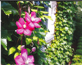
Bright, bold color never gets old when it comes to creating a striking entrance.

Statuary, fountains, obelisks and even outdoor furniture can help add a wow factor to your ever-changing garden, says Maggie. “These provide you with a year-round anchor as the garden moves through the seasons, complementing and even adding a welcome juxtaposition between the hard and soft components of your outdoor space.”