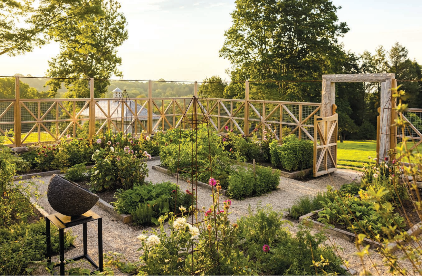
above: Tuteurs stand ready to support summer's tomatoes and dahlias in the cutting and vegetable garden. this photo: Garden fencing adds charm and keeps deer out. right: Bronze lovebirds atop the garden fence.