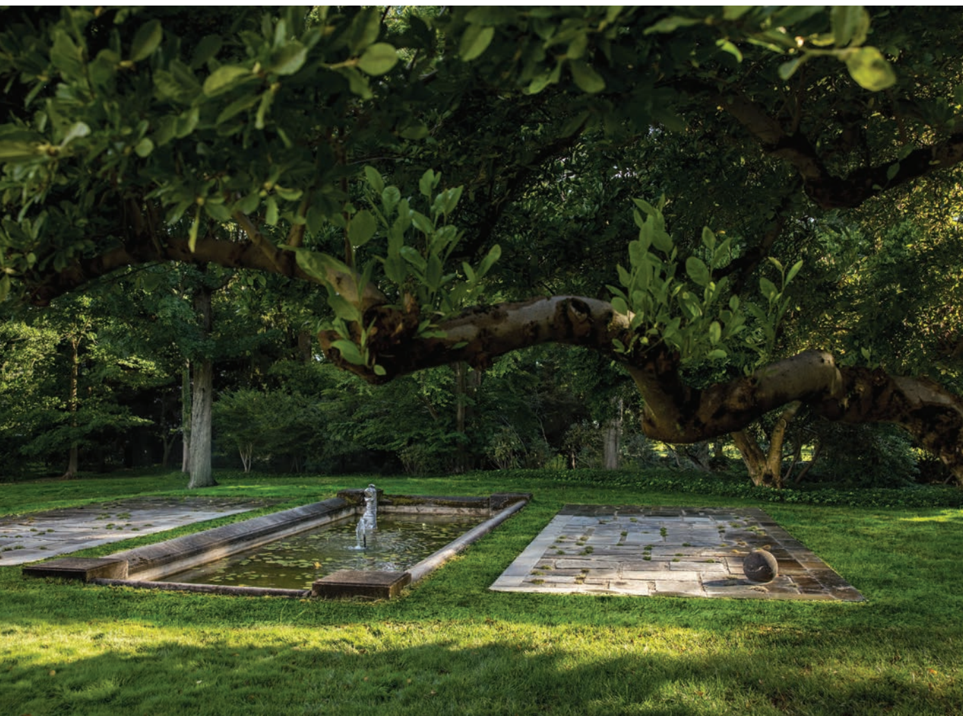
above: Refurbished stucco walls and steps planted with New Dawn Roses and Hydrangea provide a plinth for the 1927 French Manor-style home. left: New terraces comprising of antiqued stone match the patina of an existing fountain.