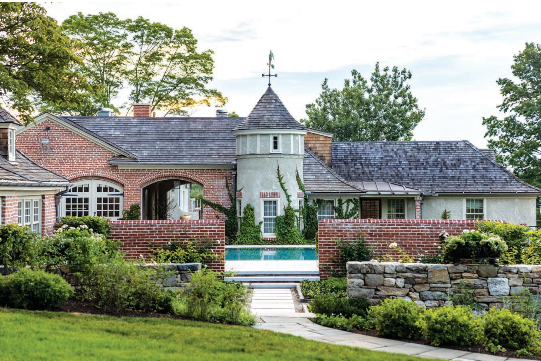
above: Loose plantings frame the main walk from the house to the pool garden. The turret in the distance is planted with Boston Ivy, softening the structure and providing seasonal interest. below, left: The same brick seen at the cottage repeats on the swimming pool. A freestanding brick wall parallels the pool, defining the space. below, right: A garden comprising of four plants; Hornbeam, English ivy, New Dawn Rose, and Boxwood creates an understated palette and provides a stage for the client's sculpture.