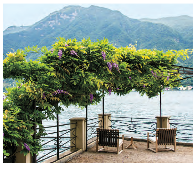
OUR GOAL WAS TO ENSURE A WALK WITH THE MOST BEAUTIFUL VIEWS AND PLANTINGS TO COMPLEMENT THIS JOURNEY