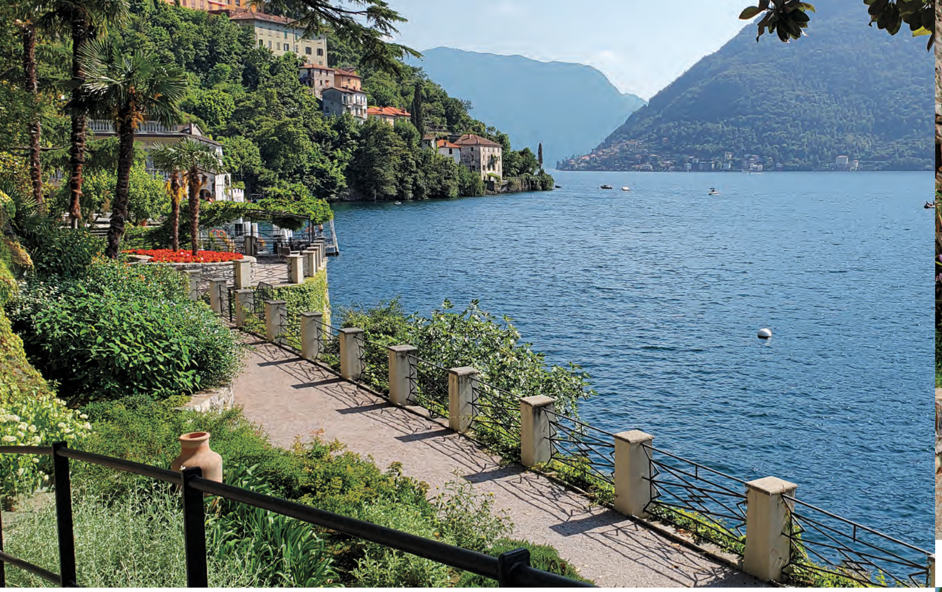
Bella Vista (CLOCKWISE ACROSS SPREAD FROM OPPOSITE PAGE) The main pathway that leads to the villa is lined with ceanothus and New Zealand flax, and passes a raised bed filled with

has been called the most beautiful lake in the world and is known for its prestigious villas and villages. It is a dreamy destination, and when a client asked if I would be interested in working with them on their newly purchased villa, there was only one answer! The real estate listing described their purchase as an "enchanting fairytale Lake Como villa with boathouses and gardens." The home sits in a bay midway between Como and Bellagio. It was built in the 1920s, transforming a villa from a much earlier period, but the home and property had fallen into a state of disrepair. Many of these villas have admirable gardens, so who could resist an opportunity to restore this one to its former glory?