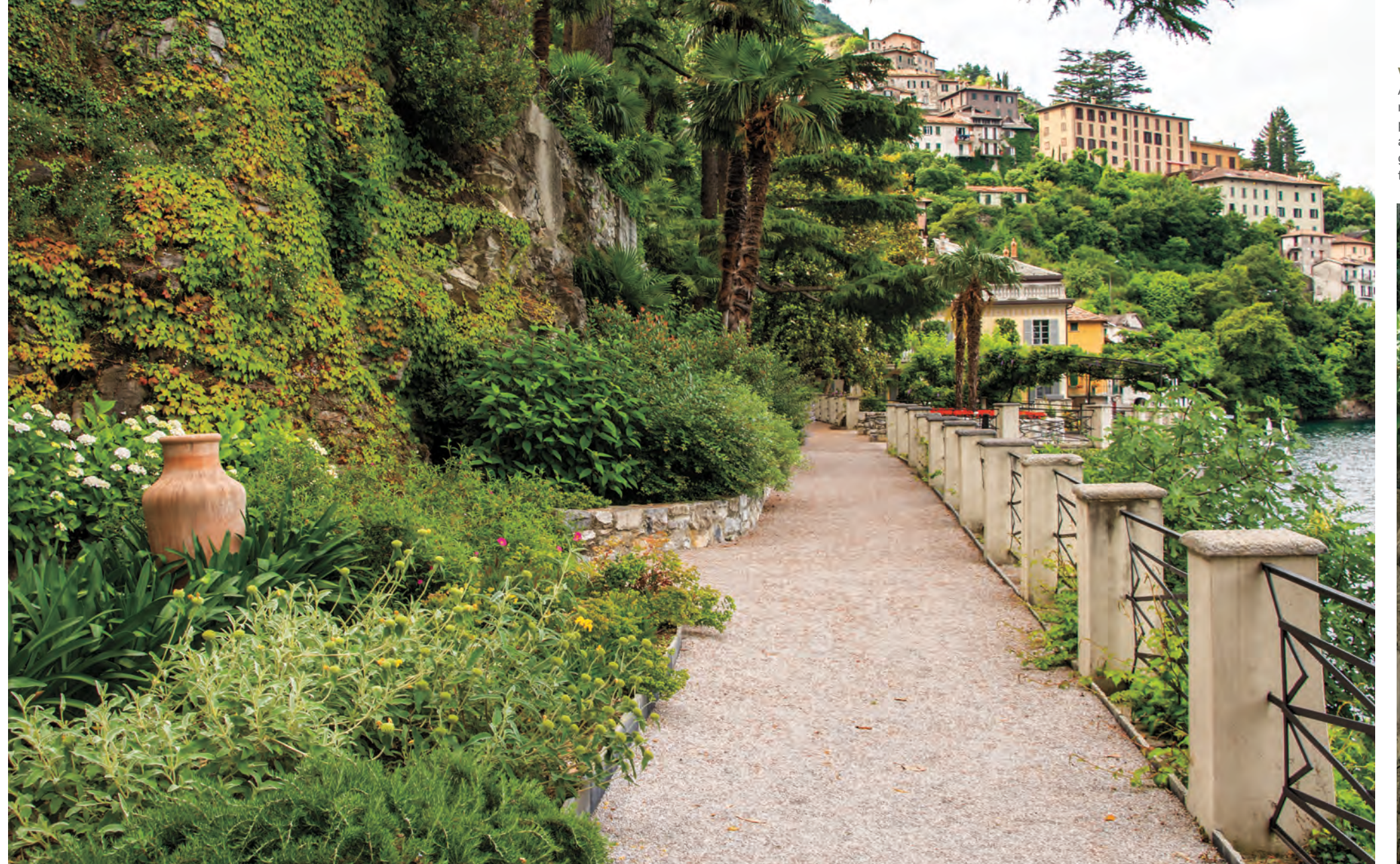
Verdant Pleasures (CLOCKWISE ACROSS SPREAD FROM FAR LEFT) A vegetable and herb garden was designed next to the restored citrus limonaia. The tropical garden includes purple and white flowering rock roses, New Zealand flax, agaves and several varieties of African Iilies. The restored grotto. The guesthouse and the grotto walkway. A view of the tropical garden from above. See Resources.